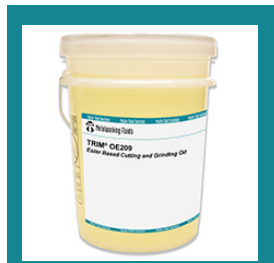
5-gallon pail SKU: OE209/5 UPC-12: 641238077374