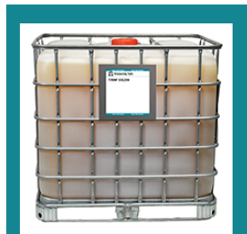
270-gallon tote SKU: OE209/NR270P UPC-12: 641238077404