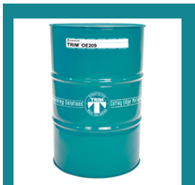
54-gallon drum SKU: OE209/54 UPC-12: 641238076650